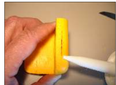
6. Seal slot & washer hole