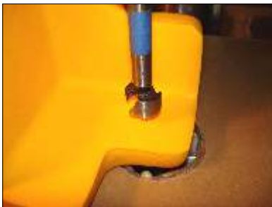
1. Use Forstner bit to drill a smooth hole on the backside.