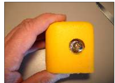
8. Attach padding

If possible put some silicone on the screw/bolt head to help seal out water.