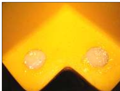
4. Fill holes with silicone