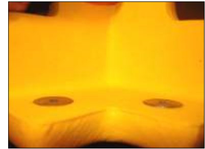
6. Washers are flush with the padding surface