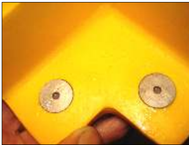
5. Insert Washers