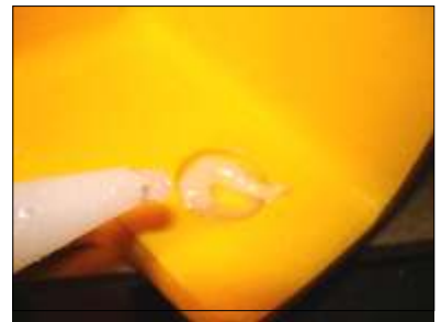
3. Apply silicone to the inside of the hole