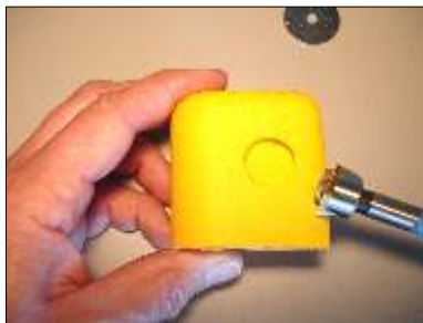
2. Drill with Forstner bit - no more than 1/2 way