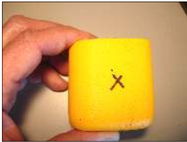
1. Mark hole location