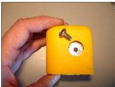
7. Insert screw/bolt