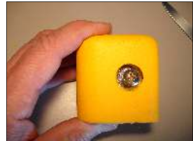
8. Attach padding

If possible put some silicone on the screw/bolt head to help seal out water.