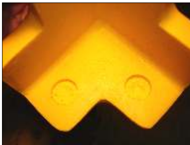
2. Depth of hole at least the thickness of the washer