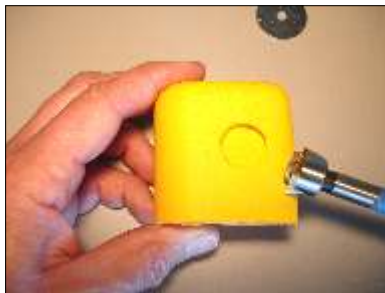
2. Drill with Forstner bit - no more than 1/2 way