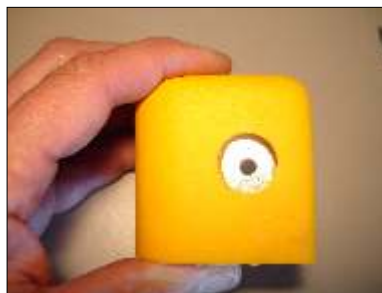
5. Center washer