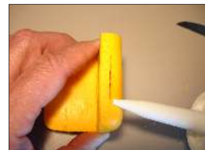
6. Seal slot & washer hole