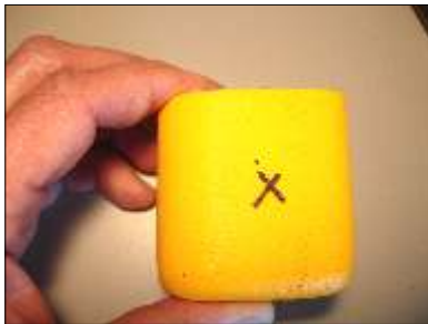
1. Mark hole location

For all applications where padding may need to be removed for maintenance or cleaning Note: Does not apply to corner strips with aluminum inserts