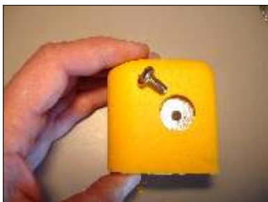
7. Insert screw/bolt