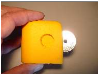
4. Insert washer